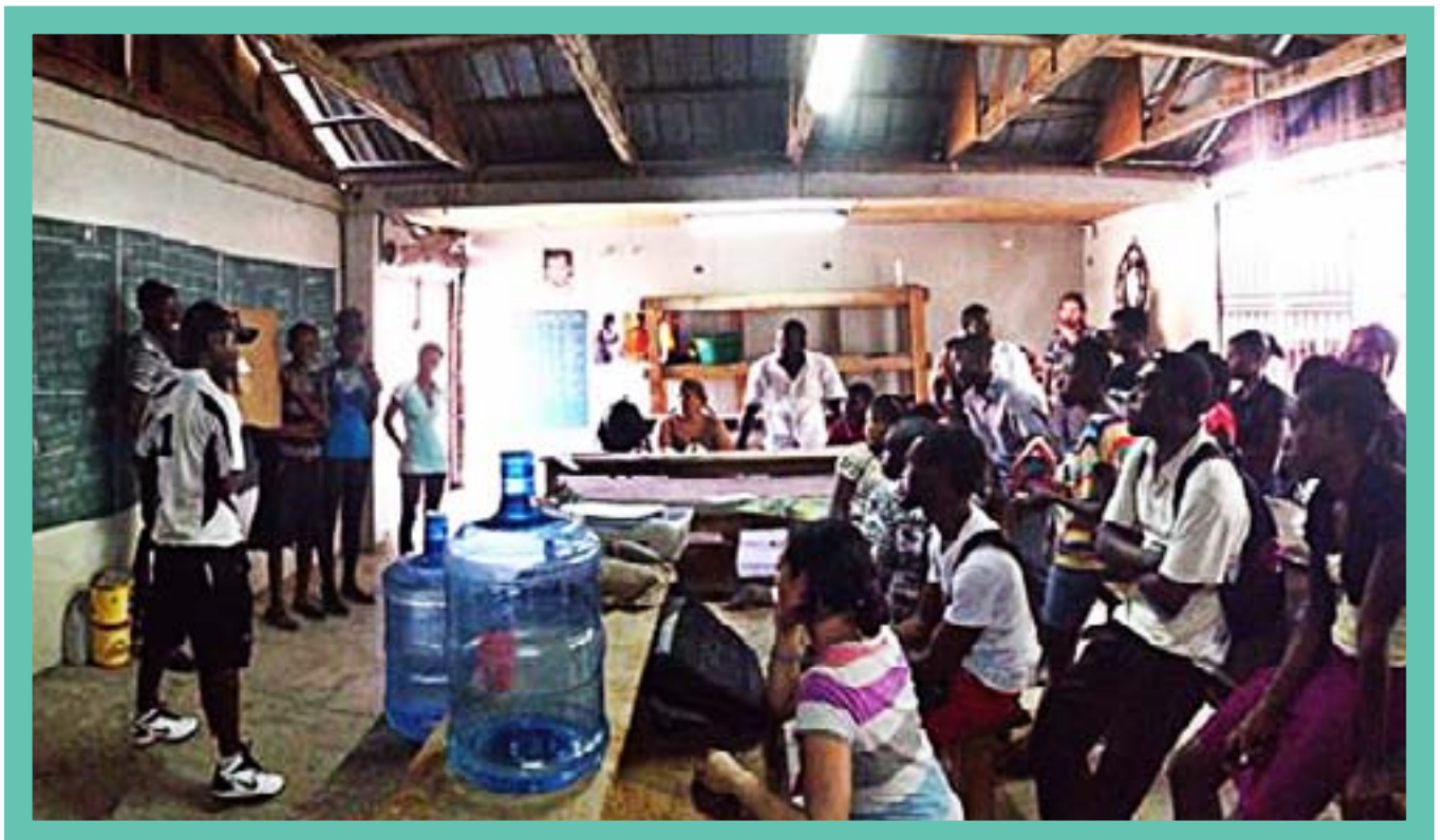
Rebuild Globally students at our first international workshop presenting ideas on how to creatively reuse rubber tire waste.